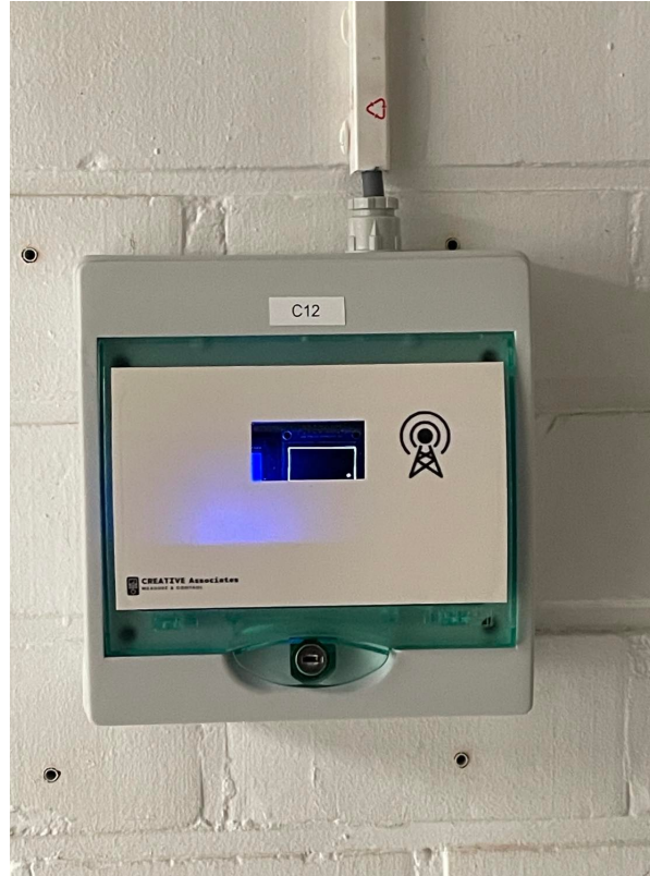
Practical Courses Room Access

At the secretariat an IoT enclosure has been configured to add and check RFID badges and via the application interface badges can be checked, assigned to or removed from students.