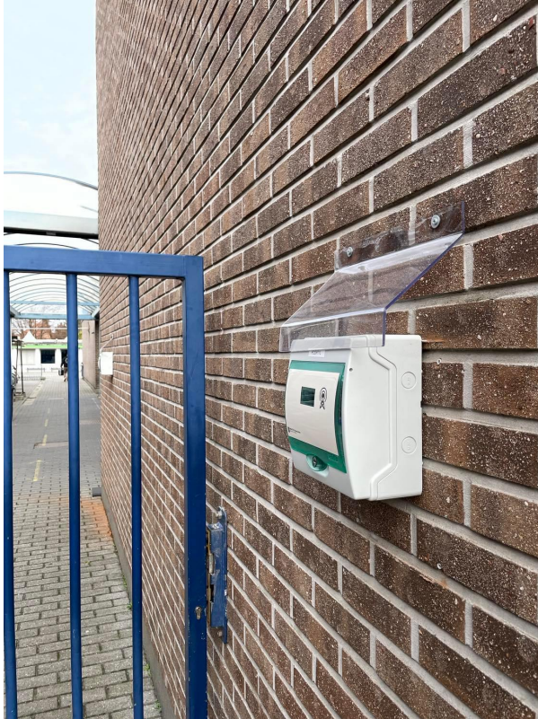
Gate Control With RFID Antenna

Data is transferred via WiFi or Ethernet communication types. All HTTP and MQTT data streams are encrypted following the AES-256 CBC standard.